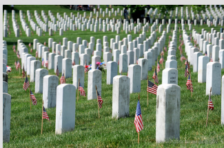
Arlington National Cemetery

ATTEND A TRAVEL STUDY TO WASHINGTON, D.C.