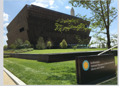
National Museum of African American History and Culture

Please note: enrollment in this course is not accessible via WINS. All students will be manually enrolled. You must email the Honors Program to request enrollment. Subject line: Yes, I wish to enroll in Honors 291: Kindred & D.C.